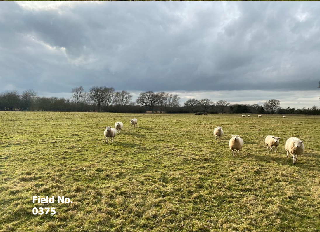
Field No. 0375