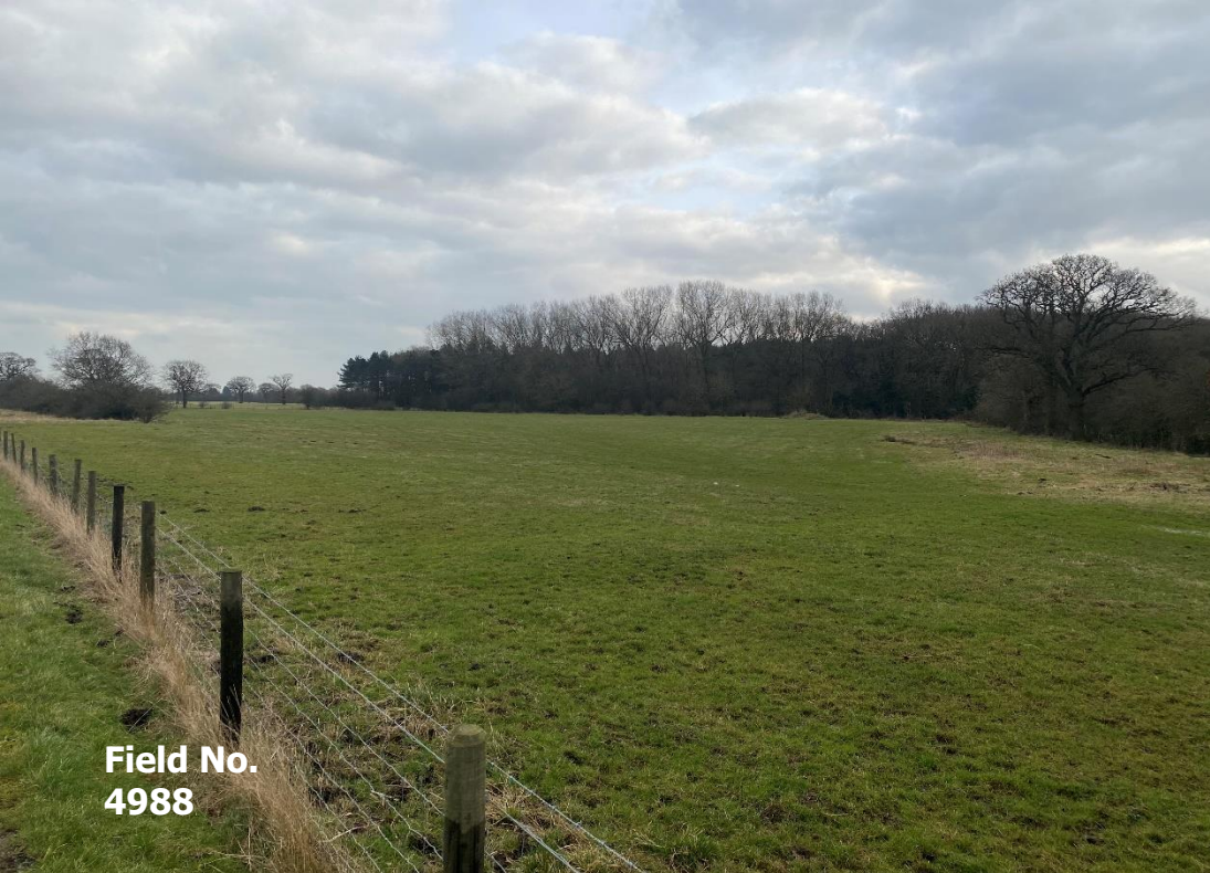
Field No. 4988