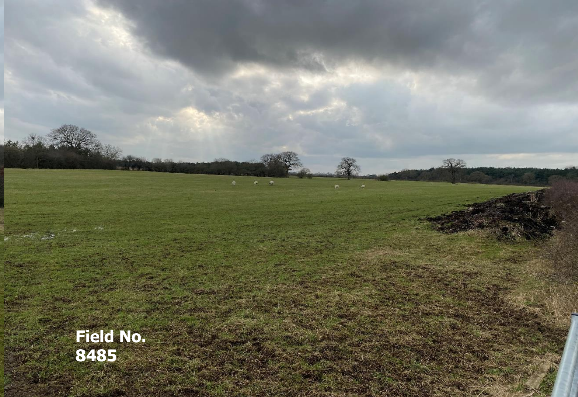
Field No. 8485